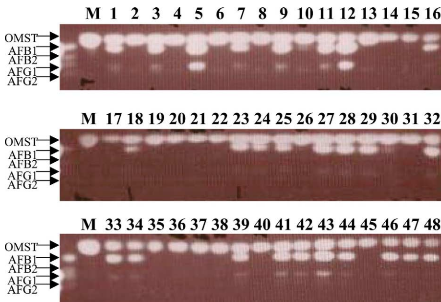
Fig. 2. Positional effect of gene integration. The survived colonies on the screening medium were putative orda gene complemented transformants. Aflatoxins and other metabolites were extracted from 3-day-old fungal mycelia culture in aflatoxin supportive medium by a standard procedure of acetone/chloroform extraction as described earlier [32]. The extracted metabolites were assayed on a thin-layer chromatography (TLC) plate (catalog no. 7001-04; 20 cm \times 20 cm silica gel; J.T. Baker, Inc.) in EMW (ether:methanol:water, 96:3:1, v/v/v) and TEA (toluene:ethyl acetate:acetic acid, 50:30:4, v/v/v) solvent systems. One fourth (20 \mu l) of the total extracted metabolites from each sample was loaded. The conversion of AFB 1 and AFB 2 from OMST in SRRC 2043 was observed in lanes 1, 3, 5, 7, 9, 11, 12, 16, 18, 23–25, 27–29, 32–34, 39, 41–44, 46–48 when the orda gene was inserted in the aflatoxin gene cluster. When the orda gene was inserted in the niaD locus it was not expressed and no aflatoxin was produced in lanes 2, 4, 6, 8, 13–15, 17, 19–22, 26, 31, 35–38, 40, 45. Lane M: OMST produced in the recipient strain A. parasiticus RHN1. The location of gene integration was confirmed by gene-specific PCR amplification (data not shown).